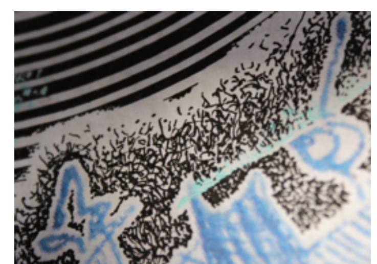
GRAPHIC ARTS detail of mixed media drawing: scan of pen-and-ink drawing combined with rapidograph technical pen. https://patreon.com/ httwcagw